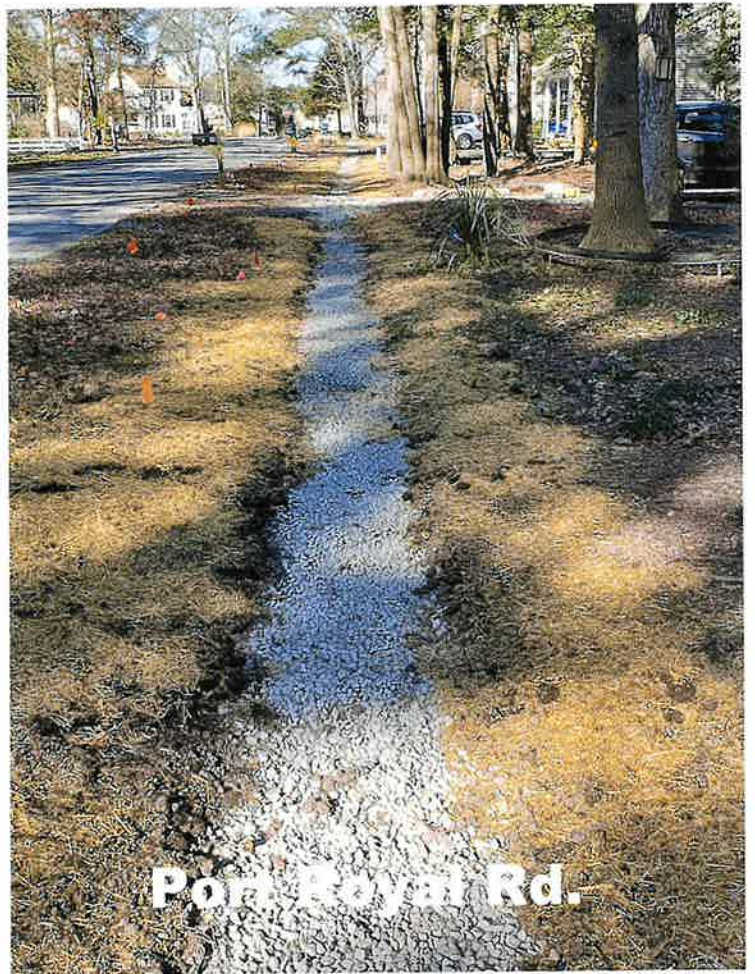
Port Royal Rd.